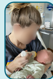
New Arrival at The WAY Home