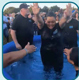
Joy of Resident Mom & Daughter Baptism