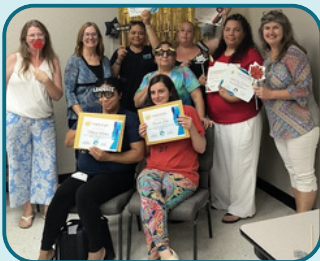
FOCUS Group Graduation Spring 2026