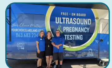
A Woman's Choice Mobile Unit Now Available at The WAY Center